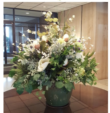
We all celebrated this St. Patrick's Day beauty from KC Snyder !